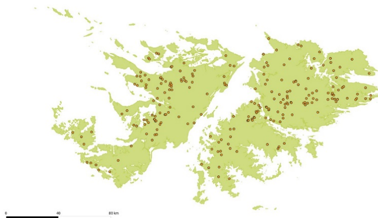
Figure 2: Map of the Falkland Islands with all scheduled soil survey points that will be visited provided permission from landowners is granted.

Satellite imagery has been selected and processed. The methodology applied is available on the project website . The first maps with soil properties have been produced (example in Figure 4) but as indicated in the methodology write-up their accuracy is uncertain due to data issues. Once these issues are resolved, the maps will be uploaded to the project's website. It is anticipated that this will be completed by the end of November 2018.