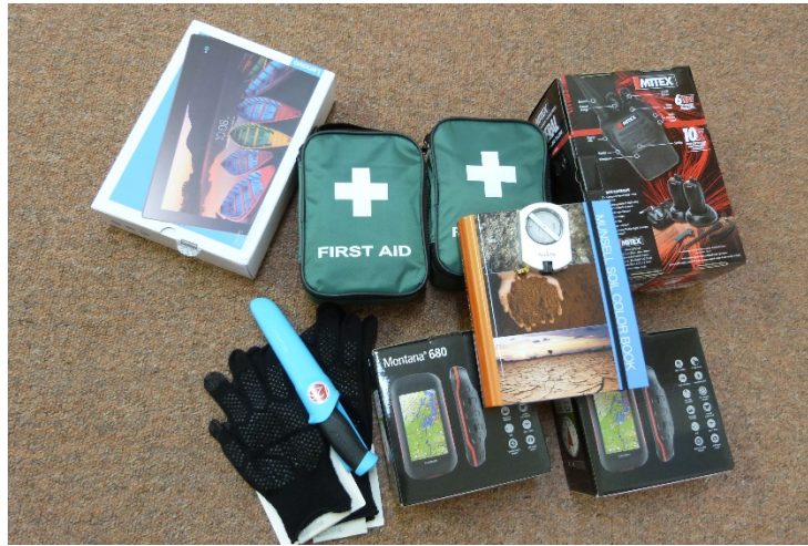
Figure 3: Equipment that has already arrived in the Falklands.